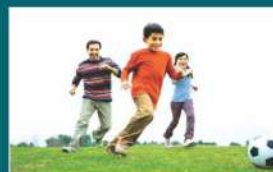
PARK & PLAY AREA